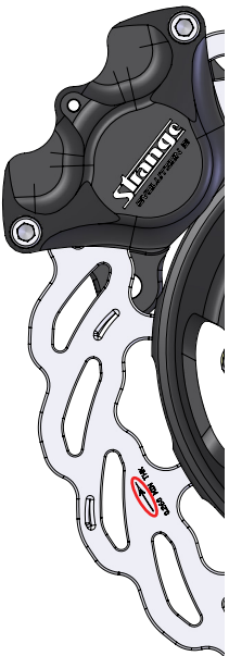
Figure # 1