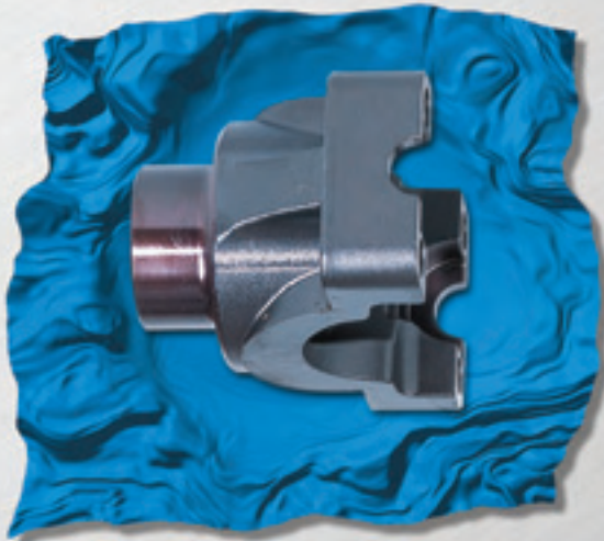
U1601 Pinion Yoke