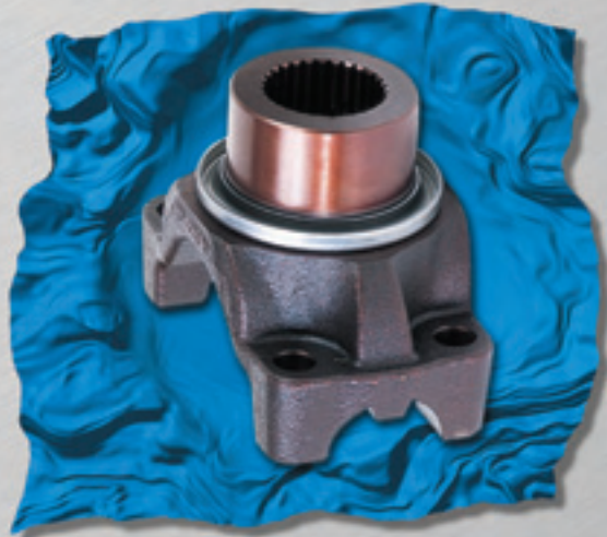
U1600 Pinion Yoke