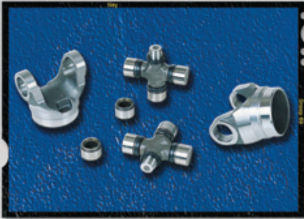
Strange chrome-moly weld ends and solid ultra impact u-joints