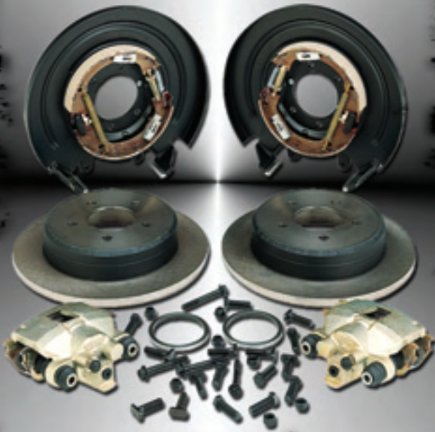
B2706WC pictured above

This Ford rear brake kit is an excellent value and ideal for street car enthusiasts.