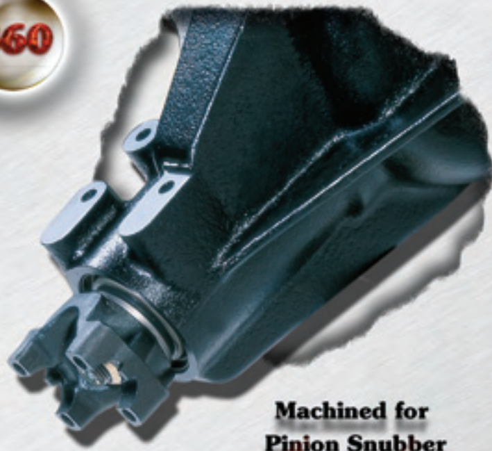
Machined for Pinion Snubber

These two pages (71 & 72) are dedicated to Mopar bolt-in and universal applications. GM bolt-in applications are listed on pages 73-76.