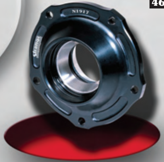
Upgrade to a "Black" aluminum support